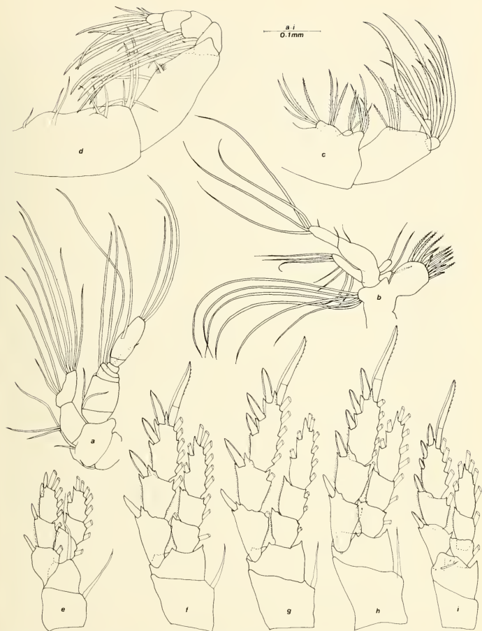
Fig. 2. Enantiosis cavernicola , female: a, Second antenna; b, First maxilla; c, Second maxilla; d, Maxilliped; e, Leg 1; f, Leg 2; g, Leg 3; h, Leg 4; i, Leg 5.

1 seta. Endopod 1-segmented, carrying 1 proximal, 1 medial and 4 terminal setae. Exopod 1-segmented, with 4 outer and 3 terminal setae.